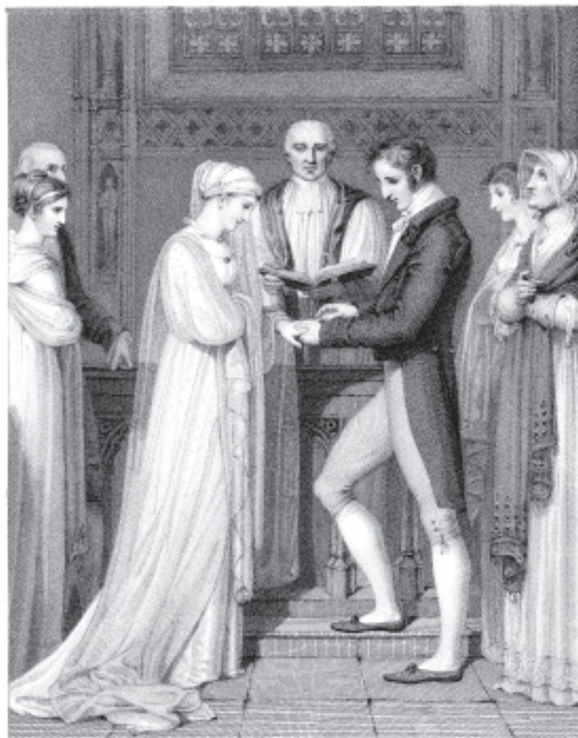
This engraving of Holy Matrimony is from an 1820 illustrated edition of the Book of Common Prayer.

"For this reason a man will leave his father and mother and be united to his wife, and the two will become one flesh. So they are no longer two, but one. Therefore what God has joined together, let not man put asunder." (Matthew 19:5-6)