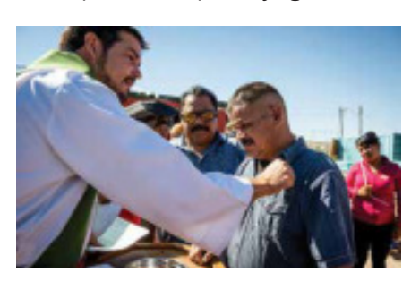
Many adults were also baptized, including parents of the baptized children—entire families born again!

Ten months later, two lines formed in front of the baptismal fonts with the crowd pressing close around. They were eager to witness the eternal miracles taking place through water and the Word in this spot near the U.S.–Mexico border —with patrol helicopters flying overhead!