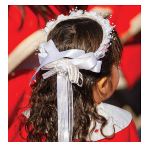
A little Mexican girl wears a braided crown to celebrate her Baptism.