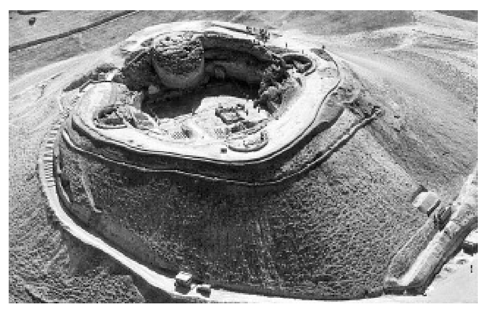
Aerial view of Heriodium, the massive fortress built by King Herod the Great near Bethlehem, about six miles south of Jerusalem, atop an artificial mountain he constructed. Later used by Roman governors, it was in an ancient storeroom at this complex that a signet ring bearing Pontius Pilate's inscription was discovered in 1969, though due to being obscured by corrosion not deciphered until last year.

In the center of the ring is a picture of a wine vessel known as a "krater," a common decorative element for artifacts of that period. It is meant to symbolize prosperity and agricultural abundance, similar to our cornucopia. Around the krater is an inscription in Greek of the name "Pilate," in a possessive form that means, "Of Pilate."