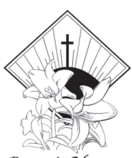
Pastor's Message for Easter