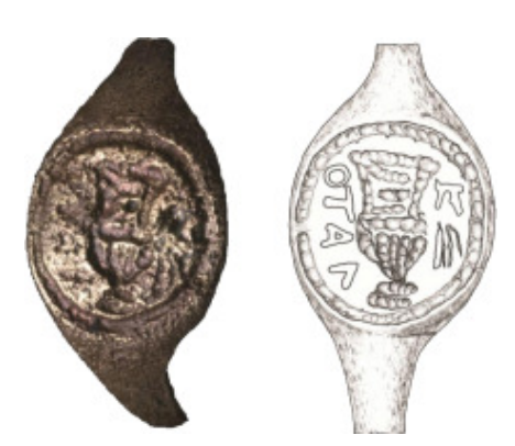
Discovered near Jerusalem in 1969 but not deciphered until last year, this signet ring was the property of Pontius Pilate and bears his inscription.

Then in 1961 a two-by-three foot stone was discovered at Caesarea with this inscription: "Pontius Pilate, Prefect of Judea, has presented this Tiberium to the Caesareans." The "Tiberium" was an amphitheater named in honor of the Roman emperor Tiberius, and this was the dedication plaque like we often still have in public buildings today. So, contrary to the critics, this irrefutable archaeological evidence provides conclusive proof not only that Pontius Pilate really existed, but also that he was the Roman prefect or governor of Judea, just as the Bible says.