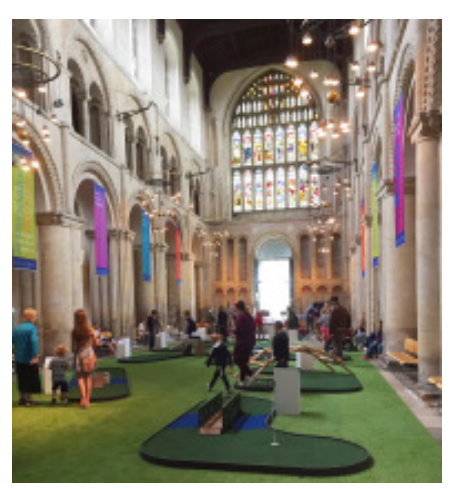
At Rochester Cathedral this summer the enormous sanctuary completed in 1238 A.D. has been completely taken over by a miniature golf course.

The Formula of Concord of the Lutheran Church puts it this way: "The churches of God in every locality and every age have authority to change such worship ceremonies according to circumstances, as may be most useful and edifying. . . Nevertheless, in this matter all frivolity and offenses should be avoided" (Article X).