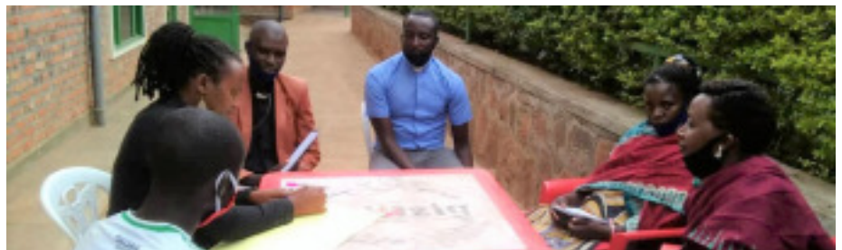
Pastors and their wives gather in Rwanda to learn more about Lutheran doctrine.

Since not all of the wives could attend, future retreats are being planned, with the hope of meeting at least three times a year.