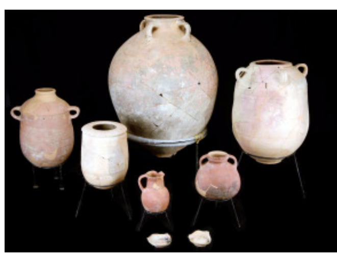
The same pottery vessels after reconstruction.

The skeptics had convinced so many that the Bible was only imaginary fiction that the stupendous results of this new discipline that came pouring back from the Holy Land rocked the world. Because, it is all there, exactly as the Bible says, exactly where it should be.